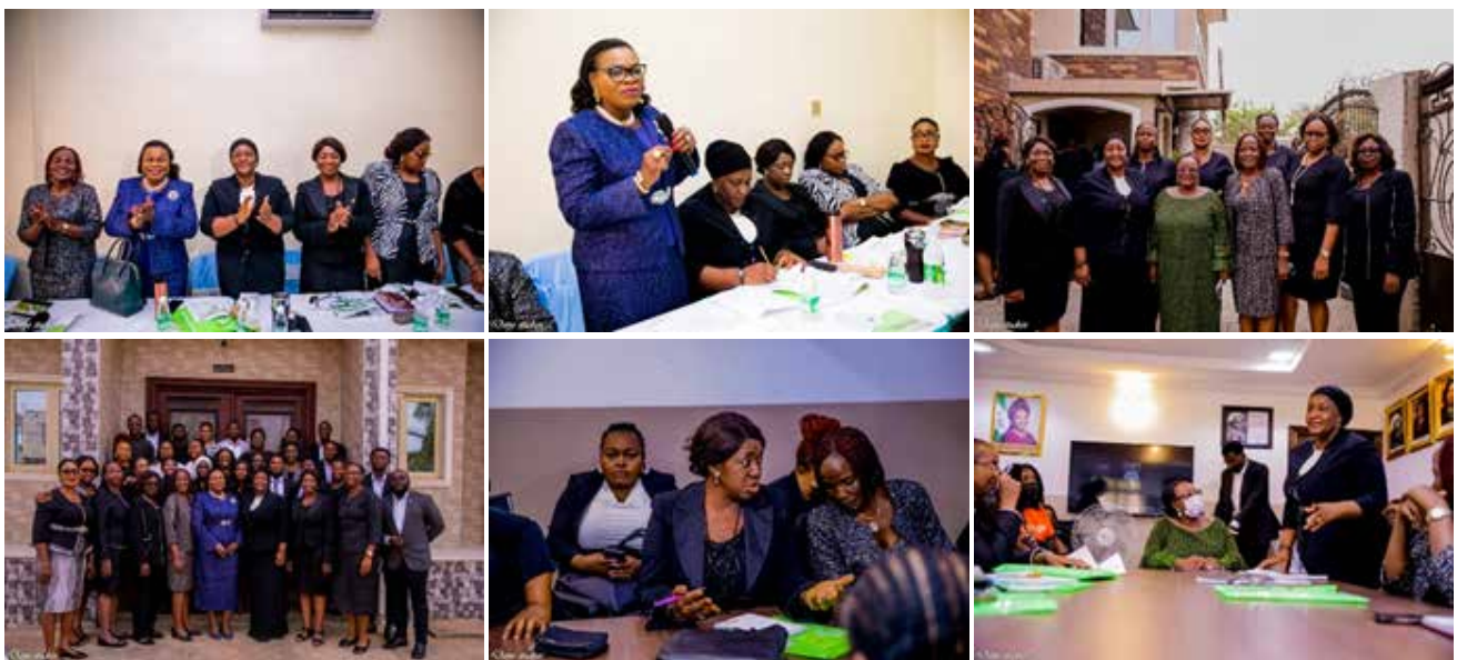
Executive and Staff Retreat 2022