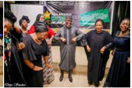
Dinner 2nd Quarter NEC Ondo