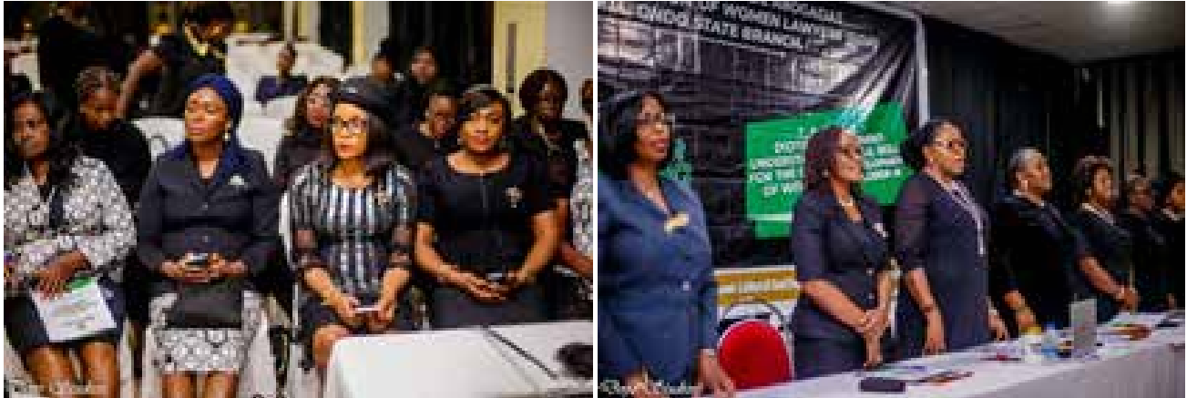
Cultural Night AGC Edo