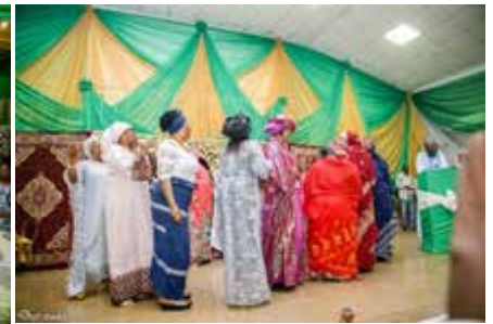
Cultural Night 2nd Quarter Bauchi