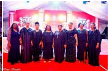
Dinner AGC EDO