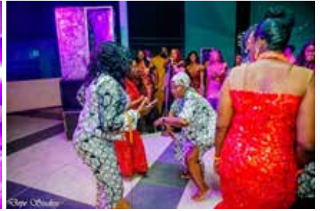
Cultural Night AGC Edo