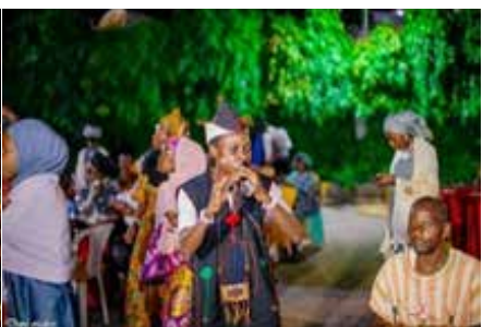
Cultural Night 2nd Quarter Kano