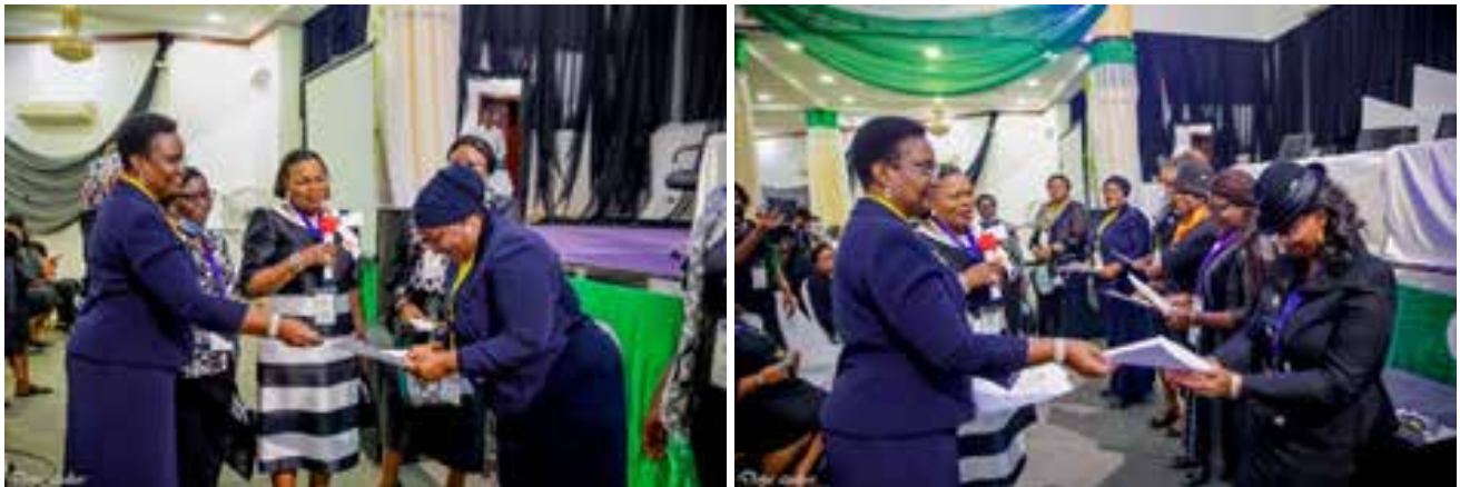
Inauguration of Executive Committee.